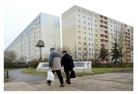
Figure 1 East German Plattenbau

While many communities in the U.S. face issues with blight and abandonment, cities in eastern Germany face similar problems with roots in their communist history. In the German Democratic Republic, the communist government quickly built many pre-fabricated concrete apartment complexes to provide housing for its residents; between 1970 and the fall of East Germany in 1994, almost two million pre-fabricated structures, or Plattenbaus, were built, housing about 30% of East Germans (Nipper, 2004, p. 64). After the reunification of Germany, residents largely abandoned these structures as they moved to western Germany in search of better economic opportunities; between 1989 and 2010, over four million people migrated from